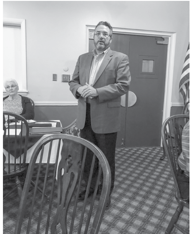
SPEAKING AT the Marion County Township Officials Meeting.